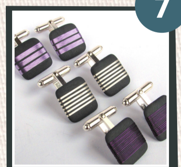
Cufflinks Tracey Birchwood, Studio 6 £65