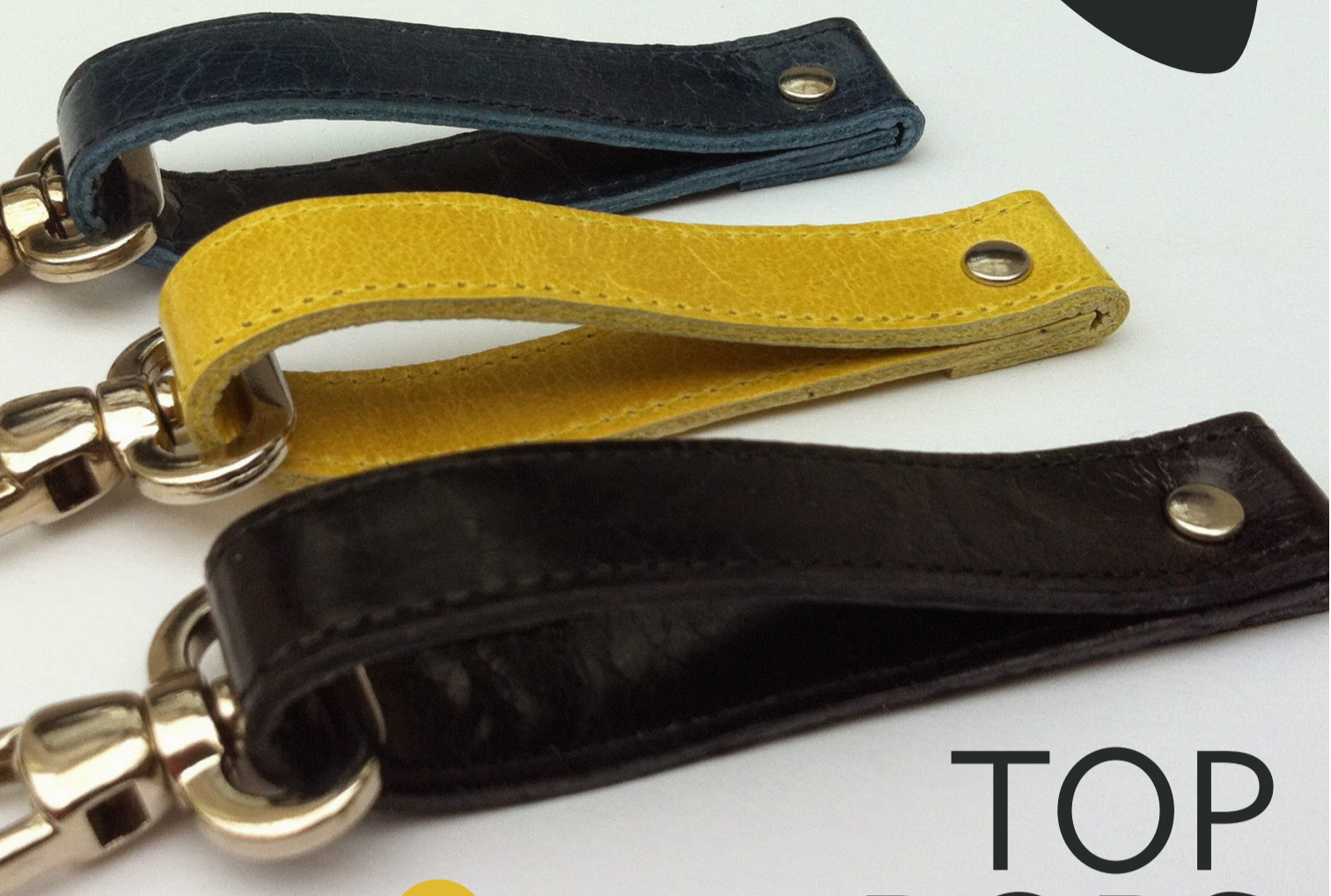
Leather loop stud keyring Devine Design, Studio 9 £10