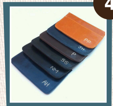
Double sided card holder Devine Design, Studio 9 £15 (with hand stitched initials £20)