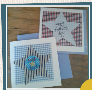
Personalised cards fibre, Studio 17 £3.50