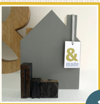
Home storage box &made, Studio 21 £20