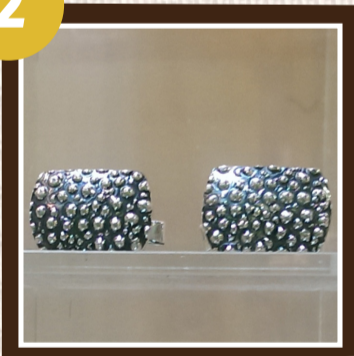
Cufflinks RA Designer Jewellery, Studio 5 Prices vary